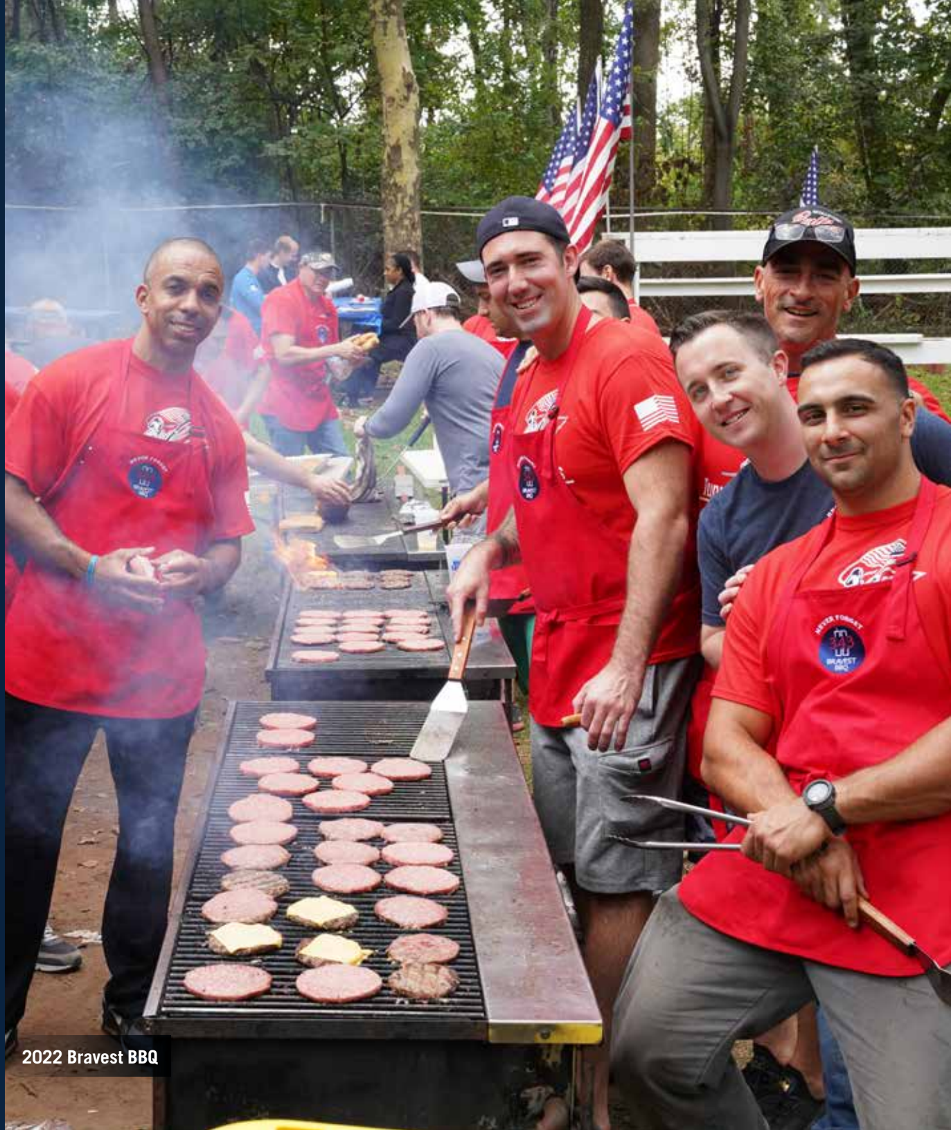
2022 Bravest BBQ

Proceeds from the Bravest BBQ go to support the Foundation's "In the Line of Duty Program," which supports our nation's military, first responders, and their families.