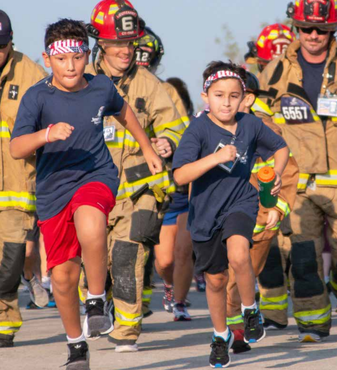
2022 Tunnel to Towers 5K Run & Walk Cypress