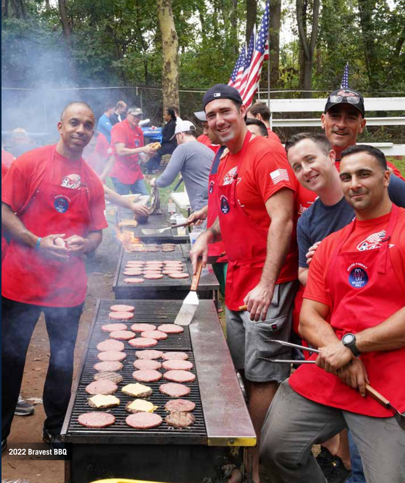
2022 Bravest BBQ

Proceeds from the Bravest BBQ go to support the Foundation's "In the Line of Duty Program," which supports our nation's military, first responders, and their families.