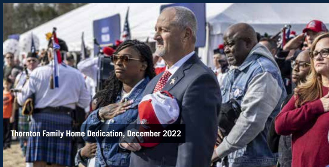
Thornton Family Home Dedication, December 2022