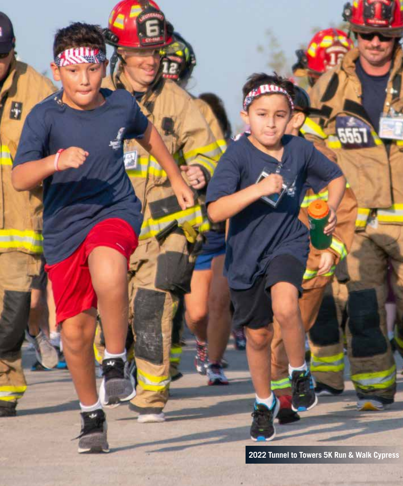
2022 Tunnel to Towers 5K Run & Walk Cypress