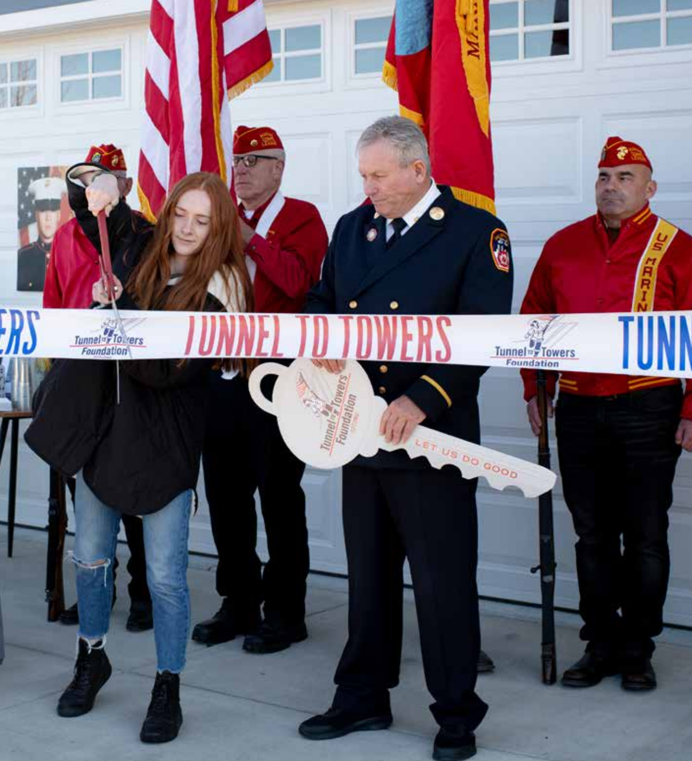
Rasmuson Gold Star Family Home Dedication, 2022